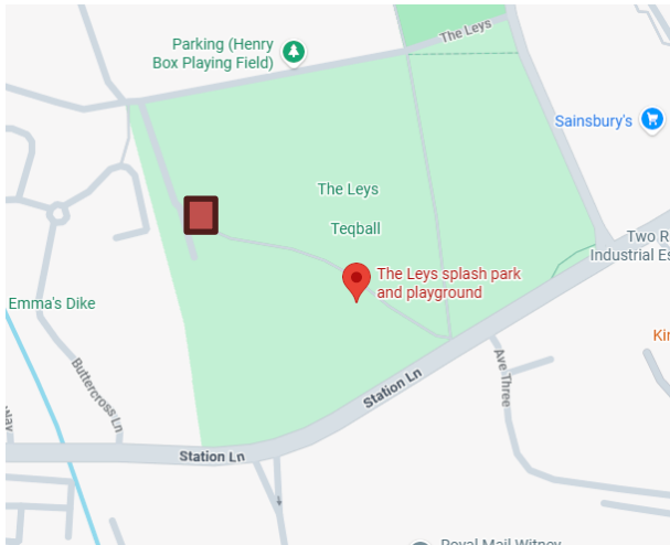
A possible location at The Leys for a central location