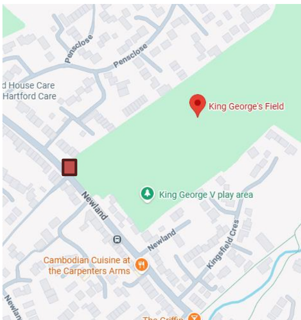
A possible location to King George Field